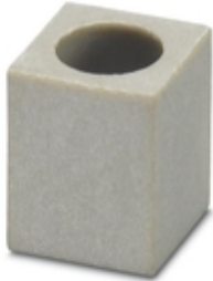
Bridge bar isolator, color: gray

Please be informed that the data shown in this PDF Document is generated from our Online Catalog. Please find the complete data in the user's documentation. Our General Terms of Use for Downloads are valid ( http://phoenixcontact.com/download )